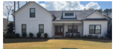
February: 884 Francis Parker Rd