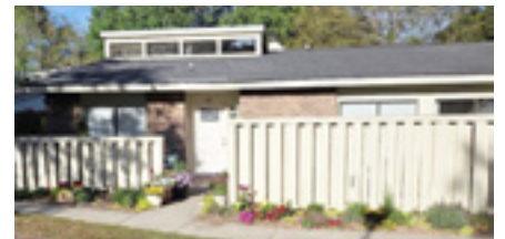
March: 49 Wedgefield Village Rd