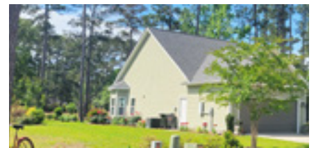
April: 603 Francis Parker Rd